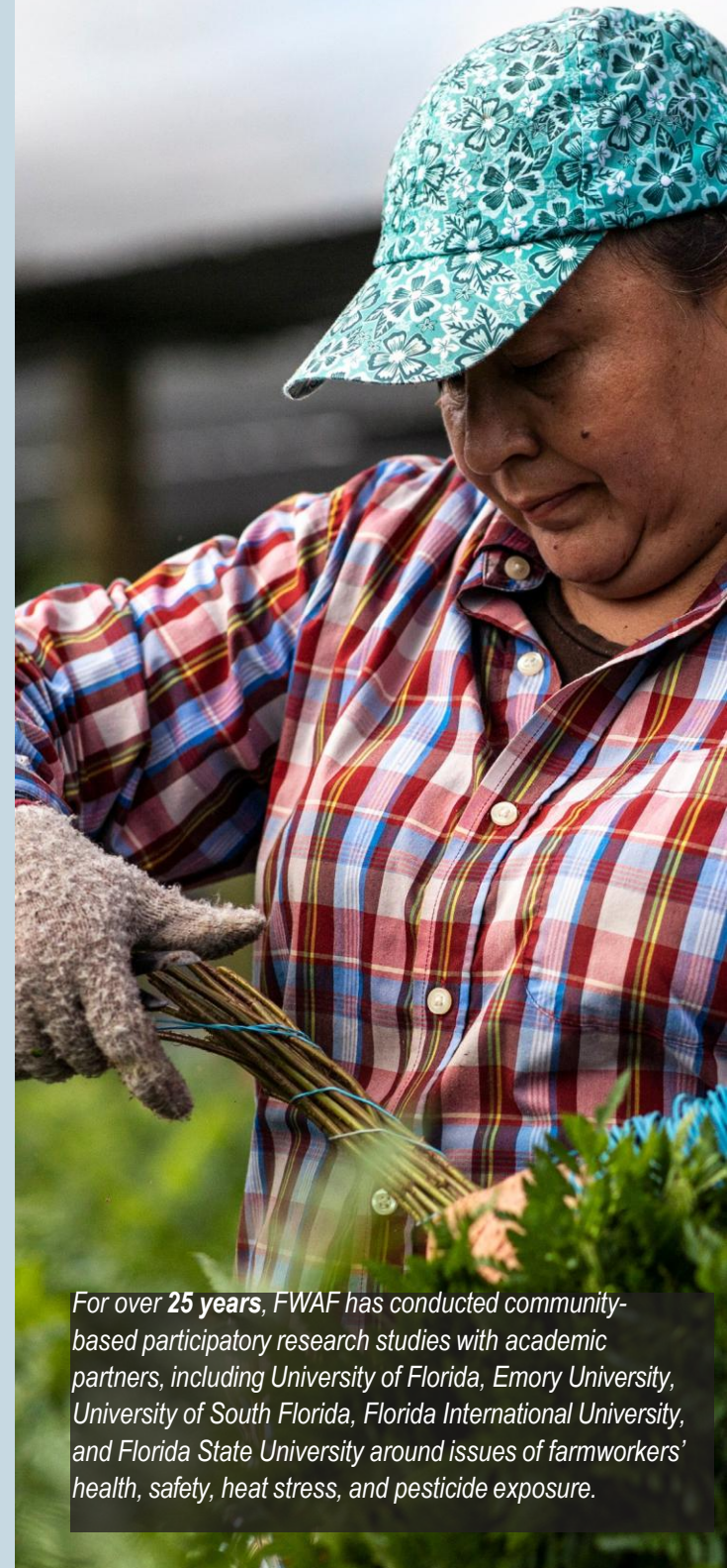
For over 25 years, FWAF has conducted community-based participatory research studies with academic partners, including University of Florida, Emory University, University of South Florida, Florida International University, and Florida State University around issues of farmworkers' health, safety, heat stress, and pesticide exposure.